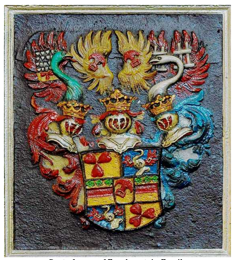
Coat of arms of Frankenstein Family

(History Society Eberstadt/Frankenstein) 64297 Darmstadt, Frankensteiner Straße 7 email: eberst.frankenstein@email.de www.eberstadt-frankenstein.de