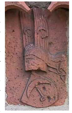
Coat of arms

Above the gate, the coat of arms with an axe can be seen. The upper part of the gate-tower with its pointed roof can clearly be recognized as newly rebuilt. The weathered sandstone round the windows especially marks the difference between the remaining masonry of the Middle Ages and the later restoration. The tower has always been open on the rear side. If ever enemies had been successful in capturing it, they could have been attacked from the core-castle.