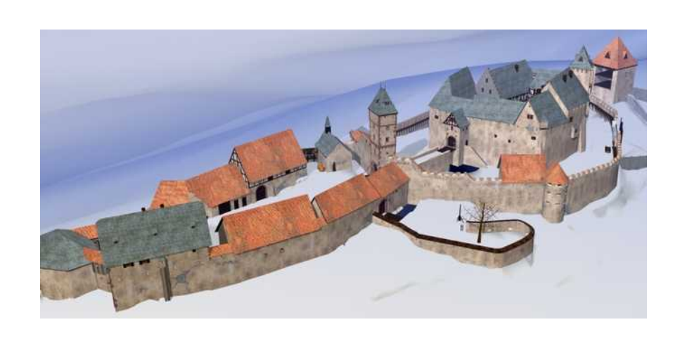
Frankenstein Castle 1550