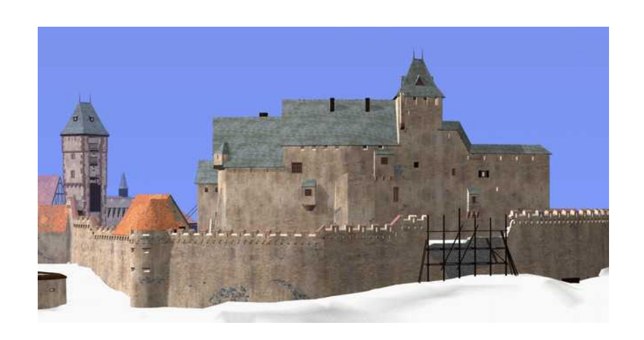
The western side of the castle 1550